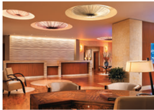
CLOCKWISE FROM FAR LEFT: THE SEAGATE BEACH CLUB; HOTEL LOBBY AND POOL; PARLOR SUITE; SPA SUITE.

The Seagate Hotel & Spa achieves a resort-meets-retreat balance, complete with sumptuous accommodations, unforgettable dining, and fun-in-the-sun activities in a comfortable, personable environment. ( theseagatehotel.com ) ◀◀