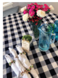
MY 2019 THANKSGIVING TABLE IN PROGRESS REMINDS US TO "GATHER WITH GRATEFUL HEARTS."