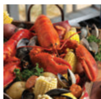
CLOCKWISE FROM TOP: THE CHÂTEAU FRONTENAC; MAINE LOBSTER BOIL; FRANKFURT CHRISTMAS MARKET; IDAHO.